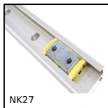
NK27 Guida mini Drylin® N, Larghezza 27 mm