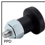
PPD Pistoncino a molla, Per lamiera