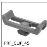
PRF_CLIP_45 Clip di fissaggio per cavi per profili alluminio, Per