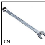
CM Attrezzi Hygienic Usit® and Hygienic Design®, Protective inserts f...