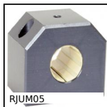
RJUM05 Supporto per boccola Drylin R®, Chiuso - Corto