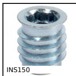
INS150 Inserto auto- maschiante a passo grosso, Con colletto -