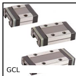
GCL Guida lineare a sfere - Sfere inox, Carello - da 516 N a 8396 N