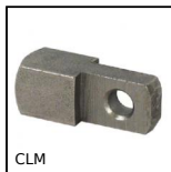
CLM Attacco per forcella, Corta inox