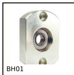
BH01 Cuscinetto radiale flangiato, Montaggio : pressione e colla