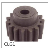
CLG1 Ingranaggio dritto in plastica stampata , Nylon stampato