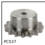
PCS37 Pignone a catena - acciaio, 9.525mm (DIN06B-1)