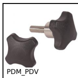
Detectable plastic palm grip, by metal