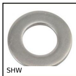
Rondella semplice, Inox A2