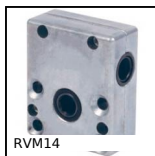
Riduttore manuale, A ruota e vite senza fine