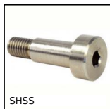
Vite a spalla inox 416, Inox 416 pretrattato