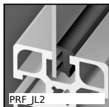
Panel accessories, Guarnizione - Ø 2mm