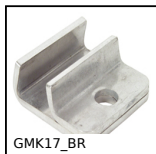
Morsetto porta guide, Conico singolo