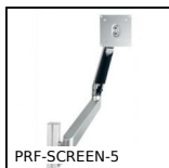
Screen support, Support with 5 axes of rotation