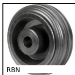
Ruota, Rivestimento in gomma - nucleo in polipropilene