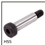
Vite a spalla di precisione ISO7379, Acciaio trattato classe 12.9