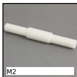
Coppia ruota e vite senza fine, Plastica lavorata (delrin)