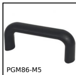
Maniglia a ponte, Termoplastica