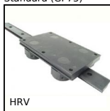
Sistema di guida su binario a V Simple