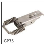
Chiusura a leva molla a trazione compensata, Standard (GP75)