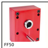
Riduttore ad alberi paralleli, da 111 a 425 Nm