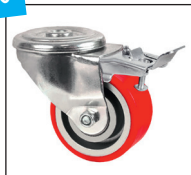
Swivel with double brake