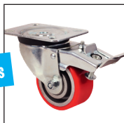
Swivel with double brake