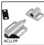
ACLLPP Sistema di chiusura, Chiusura a molla