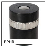
BPHR Sfera portante, Forte