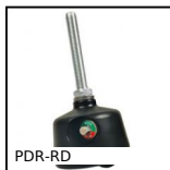
PDR-RD Piede con ruota integrata, Ruota disassata