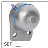
SBF Sealed flange bearing unit for Food Industry, cover