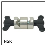
NSR Connettore rinvio d'angolo, Regolabile