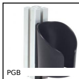
PGB Attrezzi, Porta attrezzi