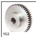
YG2 Ingranaggio dritto PRESTAZIONE, Acciaio 35NCD6