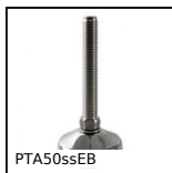
PTA50ssEB Piede snodato con base stampata Ø50, 4000N