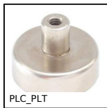
PLC_PLT Magnete, Con foro maschiato