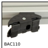
BAC110 Contenitore a becco, Aggancio orientabile