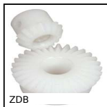
Ingranaggio conico in plastica, 2:1