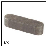
Chiavetta rettangolare, Acciaio