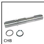
Single output shaft, For CHB gearbox