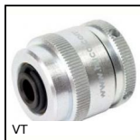
Limitatore di coppia ad attrito Vari-Tork®, 0.53 a 1.32 Nm