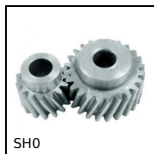
Ingranaggio elicoidale ad assi paralleli, Acciaio 20NCD2