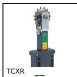
Tenditore per catena automatico, Con