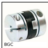
Giunto Oldham, con ganascia di serraggio