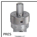
Accessori per pressa PRES-3HR e PRES-4HR, Regolazione