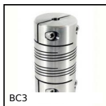
Panamech, Multi- Beam inox, Inox - con