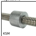
Dado cilindrico in acciaio, Acciaio - 1 filetto