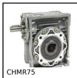
Riduttore a ruota e vite senza fine, fino a 298 Nm