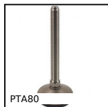
Piede snodato con base stampata Ø80, Ø 80