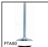
Piede snodato con base stampata Ø80, Ø 80