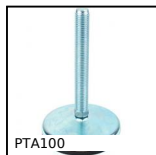
Piede snodato con base stampata Ø100, Ø 100