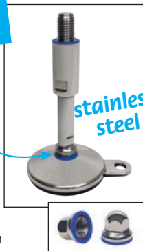
Blind M12 nut