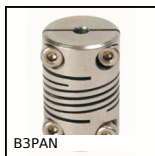
B3PAN Panamech, Multi- Beam inox, Inox - con