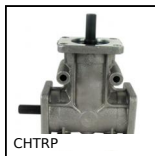
CHTRP Riduttore a rinvio angolare a L o a T, fino a 9,1 Nm