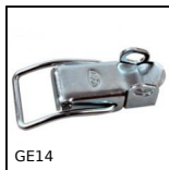
GE14 Chiusura a leva, Con porta-lucchetto