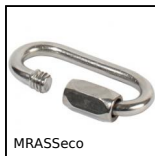
MRASeco Maglia rapida economica, Inox