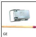
GE Chiusura a leva, Miniature