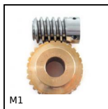
M1 Coppia ruota e vite senza fine, Bronzo