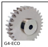
G4-ECO Ingranaggio dritto acciaio - serie ECO, Acciaio C45