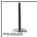
PTA100ssEB Piede snodato con base stampata Ø100, Piede snodato