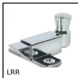
LRR Chiavistello con perno prismatico, Lucchetto a molla