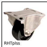
RHTplss Ruota alte temperature, fino a 200kg