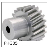
PHG05 Ingranaggio elicoidale ad assi paralleli,