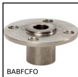
BABFCFO Perno autobloccante, Boccole di fissaggio con flangia cilindrica