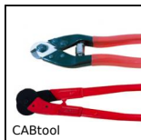
CABtool Attrezzi per cavi, Attrezzi per taglio