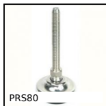
PRS80 Piede snodato tutto inox Ø80, Ø 80