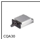
CQA30 Slitta di regolazione miniatura, 30