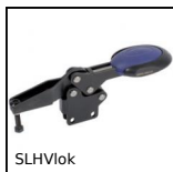
SLHVlok Bloccaggio a leva, A leva orizzontale / base