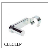
CLLCLLP Perno serie lunga, Acciaio - serie lunga