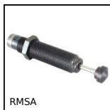
RMSA Deceleratore, Regolabile