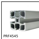
PRF4545 Profilato alluminio standard, 45 x 45 mm