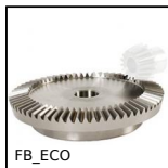
FB_ECO Ingranaggio conico - Acciaio C43 - ECO, 4:1