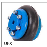
UFX Giunto elastico Uneflex®, economica