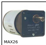
MAX26 Motoriduttore DC 12V e 24V DC, da 0,075 a 0,6Nm