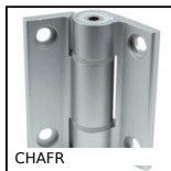
CHAFR Cerniera, A frizione