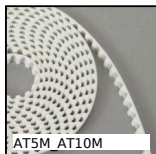
AT5M_AT10M Cinghia aperta al metro tipo AT, AT10 Poliuretano armatura in acciaio