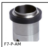
F7-P-AM Visualizzatore multifunzione, Anello magnetico