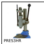
PRES3HR Pressa manuale da banco, Pressione fino a 400kg