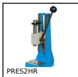
PRES2HR Pressa manuale da banco, Pressione fino a 200kg