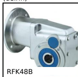
RFK48B Riduttore ipoide inox, fino a 350 Nm