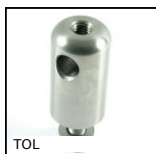
TOL Testa orientabile, Lunga