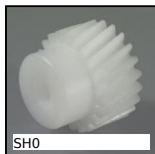
SH0 Ingranaggio elicoidale ad assi paralleli, Plastica lavorata (delrin)