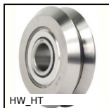
HW_HT Guida su semi-binari, Ruota