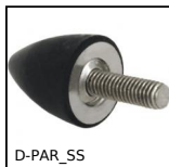
D-PAR_SS Piedino antivibrante parabolico, inox