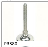
PRS80 Piede snodato tutto inox Ø80, Ø 80