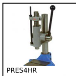
PRES4HR Pressa manuale da banco, Pressione fino a 600kg