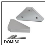
DOMI30 Kit di raccordo, Kit di raccordo XZ