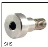
SHS Vite a spalla inox 303, Inox 303