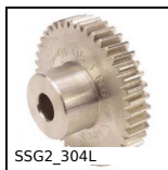
Ingranaggio dritto Inox, Inox 304L