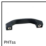
Maniglia a ponte, Fino a 250°C