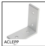
Angolare, 4 fori