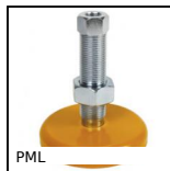
Piede massiccio per carichi pesanti, Ø 100, 120 o 150