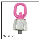
Anello di sollevamento, Con grillo ad avvitare