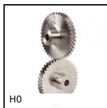
Ingranaggio elicoidale ad assi incrociati a