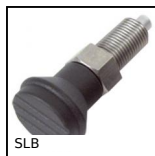
Pistoncino a molla, inox