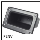
Maniglia da incasso, Ad avvitare