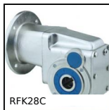
Riduttore ipoide inox, fino a 130 Nm