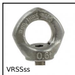
Anello di sollevamento, Orientabile maschio inox