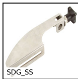
Supporto con tirante ad occhio, Inox