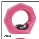
Anello di sollevamento, Orientabile femmina