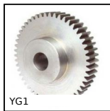
YG1 Ingranaggio dritto PRESTAZIONE, Acciaio 35NCD6