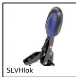
SLVHlok Bloccaggio a leva, A leva verticale / base orizzontale