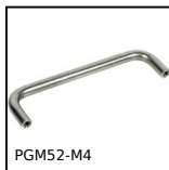
PGM52-M4 Maniglia a ponte, Ottone