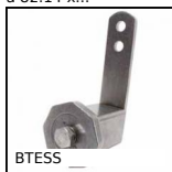
BTESS Tenditore automatico universale per tenditore, Per ambienti aggressivi