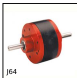
J64 Riduttore coassiale a treni paralleli, da 0.57 a 2.25 Nm - a treni p...