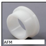
AFM Cuscinetto a collare , Polimero alimentare