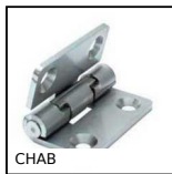
CHAB Hinge with stop, Hinge