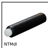
NPTMdi Grano punta in delrin, punta in delrin