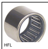
HFL Ruota libera, Combinata ad aghi