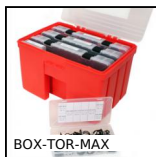
BOX-TOR-MAX Valigetta di guarnizioni toriche in nitrile, 2.90 x 1.78mm a 82.14 x...