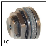
LC Limitatore di coppia ad attrito, 30 a 240 Nm