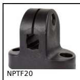
NPTF20 Morsetto di collegamento, Fisso Ø10 a Ø14