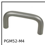
PGM52-M4 Maniglia a ponte, Alluminio