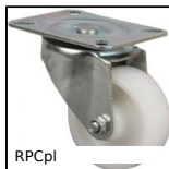
RPCpl Ruota girevole con piastra, Acciaio - Poliammide