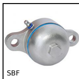
SBF Sealed flange bearing unit for Food Industry, cover