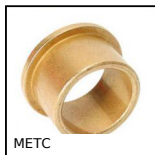
METC Cuscinetto a collare, Bronzo autolubrificante