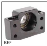
BEF Vite a ricircolo di sfere miniatura, Supporto con cuscinetto