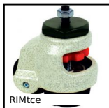
RIMtce Ruota di livellamento, Con foro centrale