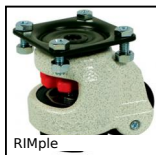
RIMple Ruota di livellamento, Con piastra