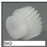
SH2 Ingranaggio elicoidale ad assi paralleli, Plastica lavorata