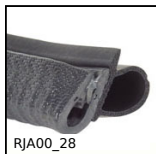
RJA00_28 Guarnizione in gomma, Da agganciare