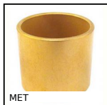
MET Cuscinetto cilindrico, Bronzo autolubrificante METAFRAM