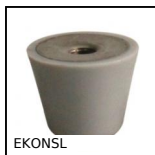
EKONSL Piedino antivibrante conico silicone, Fissaggio femmina