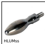
HLUMss Impugnatura girevole, Inox 316