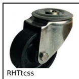
RHTtcss Ruota alte temperature con foro centrale, fino a 200kg