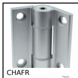
CHAFR Cerniera, A frizione