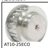
AT10-25ECO Puleggia dentata di posizionamento tipo AT, Serie economica -