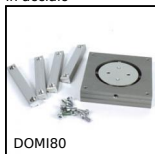
DOMI80 Accessori di collegamento, Piatto girevole