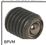
BPVM Sfera portante avvitabile miniatura, Miniatura ad avvitare