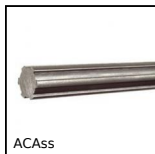
ACAss Albero scanalato Inox 304, Inox