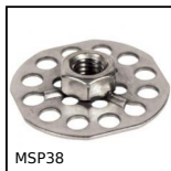
MSP38 Inserto con piastrina a incollare Masterplate®, Cilindrico Ø38 con...