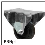
RBNpl Ruota fissa con piastra, Acciaio - caucciù