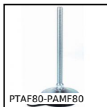
PTAF80-PAMF80 Piede fissabile con base lamiera Ø80, Ø 80