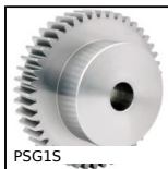
PSG15 Ingranaggio dritto di precisione, Inox 316