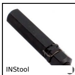
INSTool Boccola autofilettante - Attrezzo, Strumento di posa