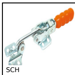
SCH Attrezzo di bloccaggio a tirante, A tirante orizzontale - acciaio