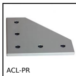
ACL-PR Elementi di giunzione, Collegamento a 90°