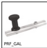
Roller for aluminium profile, Fixing kit for roller concentric