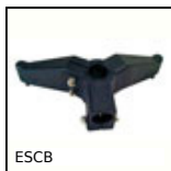
Support base, Bipod support element with cross support