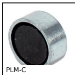
PLM-C Magnete piatto di fermo, Magnete di fermo piatto