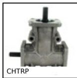
Single and dual output gearboxes, Up to 87,3Nm