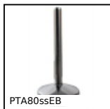
Articulated foot with sheet metal base, Articulated foot