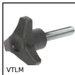
VTLM Volantino a 3 lobi, Poliammide - Acciaio