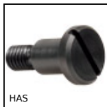
Captive C washer, Slotted flat headed shoulder screw