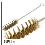
GPLbr Scovolo, ottone