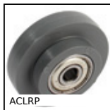
Wheel, Integrated bearing