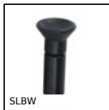
Indexing plunger, Weldable - Steel