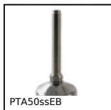
Articulated foot with sheet metal base, Articulated foot