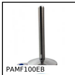
PAMF100EB Piede snodato con base stampata fissabile Ø100, Piede snodato