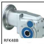
Hypoid gearbox - Stainless steel, up to 350 Nm