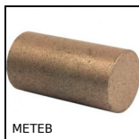
METEB Barre autolubrificanti, Bronzo BP25