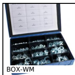
BOX-WM Rondella semplice - DIN125, Valigetta di rondelle acciaio