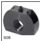
Locating bolt support bracket, Mounting holes at 90° to locating bolt