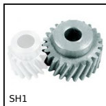
SH1 Ingranaggio elicoidale ad assi paralleli, Acciaio 20NCD2