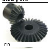
Bevel gear - Steel 60C40, 2:1