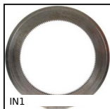
IN1 Ingranaggio interno, Acciaio 20NCD2