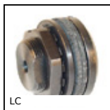
Friction torque limiter, 190 to 1800 Nm