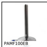
Articulated foot with sheet metal base, Articulated foot