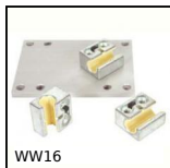
WW16 Carrello Drylin® W, Carrello