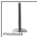
Articulated foot with sheet metal base, Articulated foot