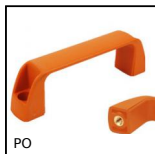
PO Maniglia a ponte - Multi-settore, Foro cieco maschiato