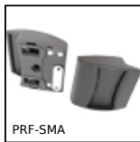
Closing system, Easily adjustable lock