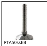
PTA50ssEB Piede snodato con base stampata Ø50, 4000N