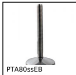
PTA80ssEB Piede snodato con base stampata Ø80, 10000N