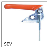
SEV Attrezzo di bloccaggio a tirante, A tirante verticale - acciaio