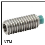
NTM Grano punta in nylon, punta in nylon