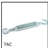
TAC Tenditore, Acciaio