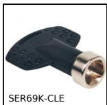
SER69K-CLE Chiusura 1/4 di giro per agroalimentare, Chiave