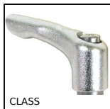
CLASS Maniglia a ripresa - femmina, Inox