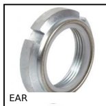
EAR Cuscinetti a sfere - Accessorio, Ghiera autobloccante - anello di fr...