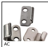
AC Pastrina di riscontro, 12,13,18 e 20mm