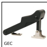
GEC Chiusura a leva in gomma con aggancio, Bloccabile