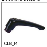
CLB_M Maniglia a ripresa, Zamak