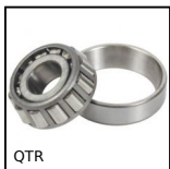
QTR Cuscinetto a rulli conici, Acciaio