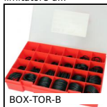
BOX-TOR-B Valigetta di guarnizioni toriche in nitrite, 20.38 x 1.78mm a 50.16 ...