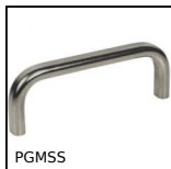
PGMSS Maniglia a ponte inox, Inox