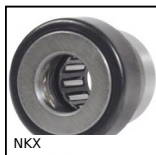
NKX Cuscinetto combinato senza anello interno, Needle and roller bearings