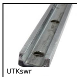
UTKswr Guida lineare Utilitrack®, Profilo guida a V