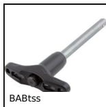
BABtss Perno autobloccante inox 303, Inox 303