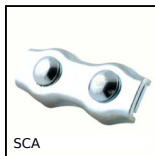
SCA Serracavo, Acciaio