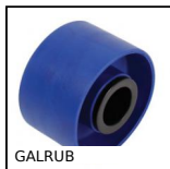
GALRUB Rullo per trasportatore, Caucciù