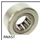
RNAST Rotelle, Senza anello interno