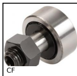
CF Perno folle, Standard - acciaio