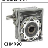
CHMR90 Riduttore a ruota e vite senza fine, fino a 540 Nm