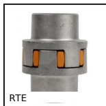
RTE Rotex®, elastico, Alluminio