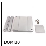
DOMI80 Accessori di collegamento, Piastra