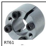
RT61 Calettatore di bloccaggio, Coppia media/bassa