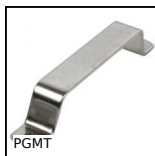
PGMT Maniglia a ponte a fissaggio anteriore, Inox