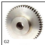
G2 Ingranaggio dritto acciaio, Acciaio 20NCD2