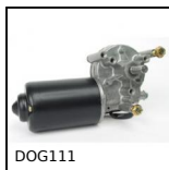
DOG111 Motoriduttore DC 12V e 24V DC, da 1.5 a 6 Nm