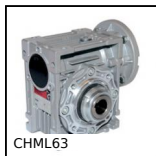
CHMR63 Riduttore a ruota e vite senza fine, fino a 138 Nm - Con limitatore ...