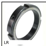
LR Cuscineetti a sfere - Accessorio, Ghiera di regolazione