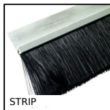
STRIP Spazzola strip, Lunghezza 3m