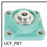
UCF_PBT Cuscinetto a flangia quadrata polimero inox, Polimero e inox