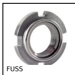
FUSS Ghiera autofrenante per cuscinetto, Ghiera autofrenante -