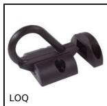
LOQ Accessori per porte, Fermaporte a scatto