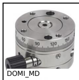
DOMI_MD Tavola rotante di regolazione Domino, 40/1