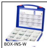
BOX-INS-W Inserto autofilettante, Box kit - Per legno