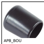
APB_BOU Asse per morsetti, Tappo di sicurezza