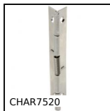
CHAR7520 Cerniera a molla, avvitabile