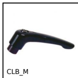
CLB_M Maniglia a ripresa, Zamak