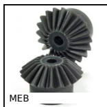
MEB Ingranaggio conico in plastica stampata, 1:1