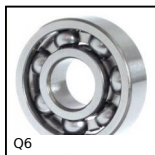
Q6 Cuscinetto radiale a sfere, Acciaio