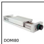
DOMI80 Slitta di regolazione Domino 80, Slitta DOMILINE 80