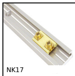
NK17 Guida mini Drylin® N, Larghezza 17 mm