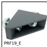
PRF19_E Squadra di giunzione, PRF19 a PRF32