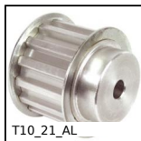
T10_21_AL Puleggia dentata di posizionamento tipo T, Serie economica - T10 all...