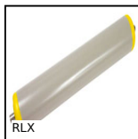
RLX Rullo folle plastica, PVC