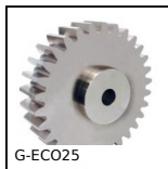
G-ECO25 Ingranaggio dritto acciaio - serie ECO, Acciaio C45