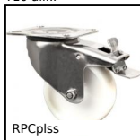
RPCplss Ruota girevole a doppio bloccaggio, Inox - poliammide