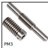
PM3 Vite senza fine, Acciaio non temprato