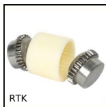
RTK Giunto Bowex®, a dentatura bombata,