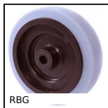
RBG Ruota, Rivestimento in gomma - nucleo in polipropilene