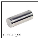
CLSCLP_SS Perno serie corta inox, Inox - serie corta