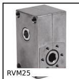
RVM25 Riduttore manuale, Rinvio angolare