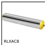
RLXAC8 Rullo folle, Acciaio