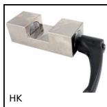
HK Accessorio di serraggio manuale,