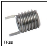
FRss Inserti filettati, Inox