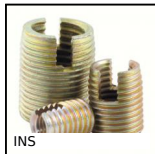
INS Boccola autofilettante acciaio, acciaio