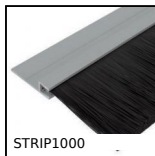
STRIP1000 Spazzola strip, Lunghezza 1m