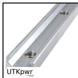
UTKpwr Guida lineare Utilitrack®, Profilo guida a V