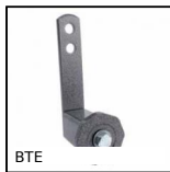
BTE Tenditore automatico universale, Per applicazioni correnti