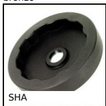
SHA Volantin pieno, Poliammide