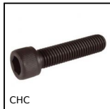
CHC Vite a testa cava esagonale CHC, Acciaio classe 12.19