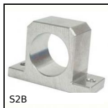
S2B Supporto corto per manicotto chiuso a sfere, Chiuso - Corto