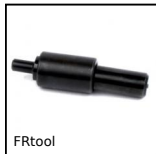
FRtool Attrezzi per inserti filettati, Attrezzo di posa