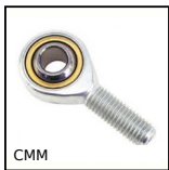
CMM Testa a snodo maschio DIN ISO12240-4, Acciaio / bronzo