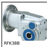
RFK38B Riduttore ipoide inox, fino a 200 Nm