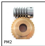
PM2 Coppia ruota e vite senza fine, Bronzo