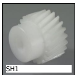
SH1 Ingranaggio elicoidale ad assi paralleli, Plastica lavorata (delrin)