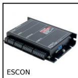
ESCON Variatore di velocità 5A, 5 A