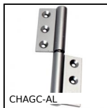
CHAGC-AL Cerniera ad avvitare, Sfilabile