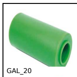
GAL_20 Rullo per trasportatore, Polietilene