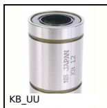
KB_UU Manicotto a sfere di precisione, Di precisione - acciaio