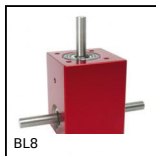
BL8 Rinvio angolare, da 0.20 a 2 Nm