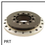
PRT Corona girevole Iglidur®, Iglidur®, alluminio e inox