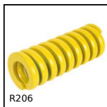
R206 Molla per stampi ISO10243, Extra-forte