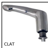
CLAT Maniglia a ripresa Hygienic Usit®, Inox