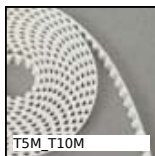
T5M_T10M Cinghia aperta al metro, T5 Poliuretano armatura in acciaio