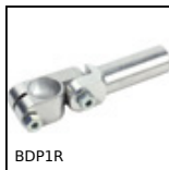
BDP1R Braccio di reazione, Serraggio standard