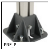
PRF_P Elementi di ancoraggio, Base di ancoraggio