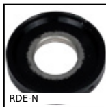
RDE-N Rondella di tenuta Hygienic Usit®, Inox - EPDM nero