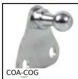
COA-COG Molla a gas, Staffa di montaggio piana per snodo