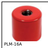
PLM-16A Magnete, Con foro maschiato