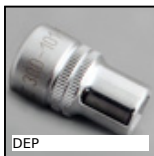
DEP Attrezzi Hygienic Usit® and Hygienic Design®, Bussole per il montaggio di