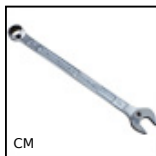
CM Tools Hygienic Usit® and Hygienic Design®, Combination spanner