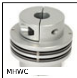
MHWC Giunto flessibile, Disco doppio