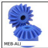
MEB-ALI Ingranaggio conico in plastica stampata (nylon), 1:1