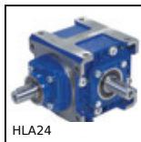
HLA24 Rinvio angolare a dentatura spiroidale, Fino a 78Nm