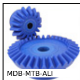
MDB-MTB-ALI Ingranaggio conico in plastica stampata (nylon), 2:1