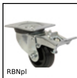
RBNpl Ruota girevole a doppio bloccaggio, Acciaio - caucciù