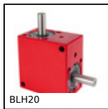
BLH20 Rinvio angolare, da 0.53 a 1.77