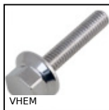
VHEM Hexagonal headed bolt with collar Hygienic Usit®, Inox