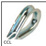
CCL Capocorda ad occhiello, Acciaio