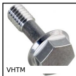
VHTM Hexagonal headed bolt Hygienic Design®, Inox