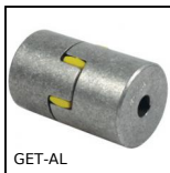
GET-AL Giunto elastico alluminio serie eco., Alluminio