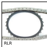
RLR Tenditore per catene Roll-Ring®, Roll-Ring® Self-adjusting