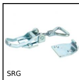
SRG Chiusura a leva regolabile, Corsa da 117,4mm a 128mm