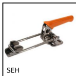
SEH Attrezzo di bloccaggio a tirante, A tirante - inox