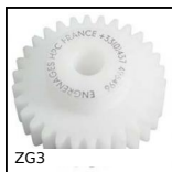
ZG3 Ingranaggio dritto in plastica, Plastica lavorata (delrin)