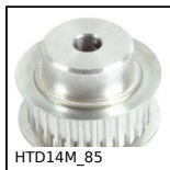
HTD14M_85 Puleggia dentata di trasmissione tipo HTD, HTD14 Acciaio