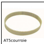
AT5courroie Cinghia chiusa posizionamento AT, AT5 Poliuretano armatura in acciaio