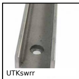
UTKswrr Guida lineare Utilitrack®, Profilo guida a V