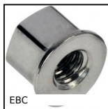
EBC Dado cieco Hygienic Design®, Compatto