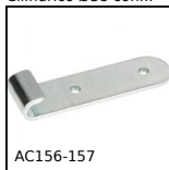
AC156-157 Riscontro per chiusura a leva rigida ad anello, 25.5mm