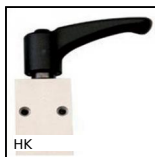
HK Accessorio di serraggio manuale, Serraggio manuale T