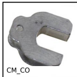
CM_CO Attrezzi Hygienic Usit® and Hygienic Design®, Protective inserts f...