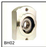
BH02 Cuscinetto radiale flangiato, Montaggio con circlips