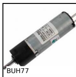
BUH77 Motoriduttore DC 12V e 24V DC, da 0.1 a 2 Nm