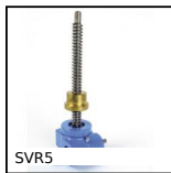
SVRS Martinetto a vite - Vite rotante, Con madrevite esterna