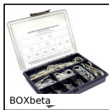
BOXbeta Box kit di spine beta, Box kit - beta