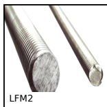
LFM2 Vite trapezoidale acciaio, Acciaio semiduro - 2 filetti