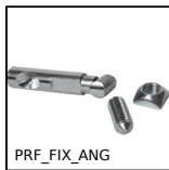
PRF_FIX_ANG Fissaggio, Fissaggio angolare