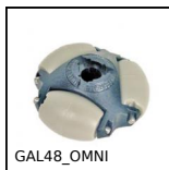
GAL48_OMNI Ruota per trasportatore, Omnidirezionale