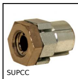
SUPCC Calettatore di bloccaggio autocentrante acciaio, Con ghiera