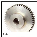
G4 Ingranaggio dritto acciaio, Acciaio 20NC2