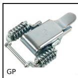
GP Chiusura a leva molla a trazione compensata, Standard