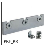
PRF_RR Elementi di giunzione, Piastra di raccordo