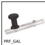
PRF_GAL Rotella per profilo alluminio, Kit di fissaggio per rotella concentr...