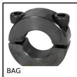
BAG Anello di bloccaggio in acciaio, Acciaio