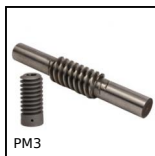
PM3 Coppia ruota e vite senza fine, Acciaio trattato