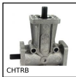
CHTRB Riduttore a rinvio angolare a L o a T, fino a 87,3 Nm