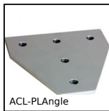
ACL-PLAngle Elementi di giunzione, Collegamento angolare