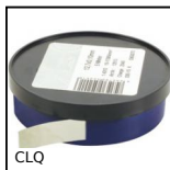
CLQ Cuscinetti a sfere - Accessorio, Spessori metallici centesimali a na...