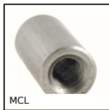
MCL Manicotto cilindrico maschiato, Cilindrico - inox