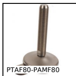
PTAF80-PAMF80 Piede fissabile con base lamiera Ø80, Ø 80