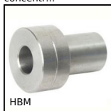
HBM Guida su semi-binari, Boccola di regolazione