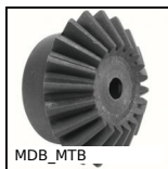
MDB_MTB Ingranaggio conico in plastica stampata ,