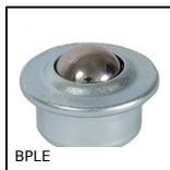
BPLe Sfera portante a incastro, Leggero