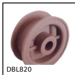
DBL820 Rotella per catena, Serie 820 e 815