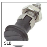
SLB Pistoncino a molla, inox