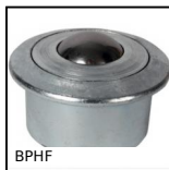
BPHF Sfera portante a incastro con flangia, Forte