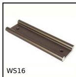
WS16 Binario Drylin® W, Binario