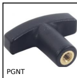
PGNT Impugnatura termoplastica a T, Con inserto maschiato