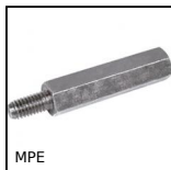
MPE Distanziatore esagonale, Acciaio