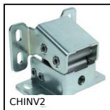
CHINV2 Cerniera invisibile, Invisibile - Apertura fino a 125°