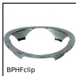
BPHFclip Sfera portante, Anello di fissaggio - montaggio dall'alto