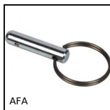
AFA Perno di fissaggio, con anello