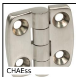
CHAEss Cerniera estetica, Inox