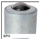
BPH Sfera portante a incastro cilindrico, Forte