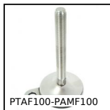
PTAF100-PAMF100 Piede fissabile con base lamiera Ø100, Ø 100