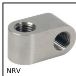
NRV Morsetto incrociato, Montaggio e regolazione rapidi