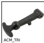
ACM_TRI Tirante chiusura in gomma, Caucciù