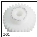
ZG1 Ingranaggio dritto in plastica, Plastica lavorata (delrin)