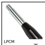
LPCM Leva con impugnatura cilindrica, Duroplast nero, leva in acciaio