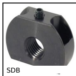
SDB Pistoncino a molla - Supporto, fissaggio perpendicolare alla serratura