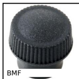
BMF Manopola, Zigrinata - Cieco