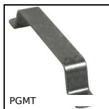
PGMT Maniglia a ponte, Acciaio