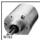
NT92 Riduttore coassiale a treni paralleli, da 15 a 40 Nm - a treni paral...