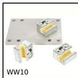
WW10 Guida Drylin® W, Carrello