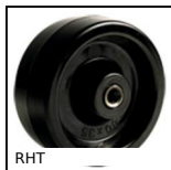
RHT Ruota alte temperature, fino a 200kg