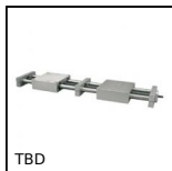
TBD Tavola di posizionamento a passo inverso manuale, 2kg