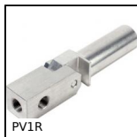
PV1R Braccio portaventosa orientabile, Serraggio standard