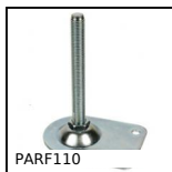
PARF110 Piede senza snodo, Piede snodato oscillante fissabile