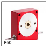
P60 Riduttore a ruota e vite senza fine, fino a 118 Nm