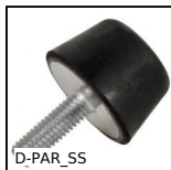
D-PAR_SS Piedino antivibrante parabolico, inox