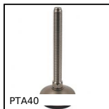
PTA40 Articulated foot with solid base foot Ø 40, 3000N