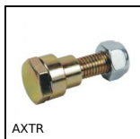
AXTR Puleggia folle, Perno