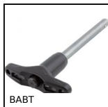
BABT Perno autobloccante, Inox temprato