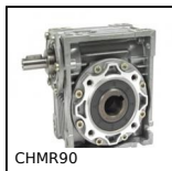
CHMR90 Riduttore a ruota e vite senza fine, fino a 540 Nm