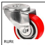
RURt Ruota girevole a foro centrale, Poliuretano - Mozzo alluminio (Ultra...