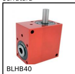
BLHB40 Rinvio angolare ad albero cavo, fino a 10.3 Nm