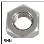
SHN Dado esagonale - DIN934, Acciaio (Class 6[8])