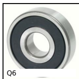
Q6 Cuscinetto radiale a sfere, Acciaio