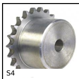
S4 Pignone a catena - Inox, 4mm