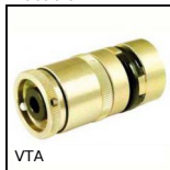
VTA Limitatore di coppia ad attrito Vari-Tork®, 0.53 a 1.32 Nm