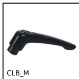
CLB_M Maniglia a ripresa, Zamak