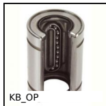
KB_OP Manicotto a sfere di precisione, Di precisione - acciaio