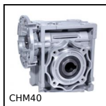
CHM40 Riduttore a ruota e vite senza fine, fino a 130 Nm