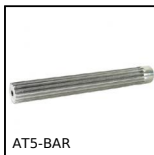
AT5-BAR Barra dentata, AT5