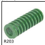
R203 Molla per stampi ISO10243, Leggero