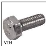
VTH Vite a testa esagonale, Acciaio classe 8.8