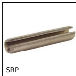
SRP Spina cilindrica ISO8752, elastica ISO 8752