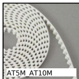
AT5M AT10M Cinghia aperta al metro tipo AT, AT5 Poliuretano armatura in acciaio