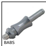
BABS Perno autobloccante a sfere inox 630, Inox temprato