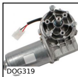
DOG319 Motoriduttore DC 12V e 24V DC, da 4 a 9 Nm