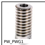
PW_PWG1 Vite senza fine di precisione, Inox