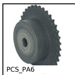
PCS_PA6 , 12.7mm (DIN 08B-1)