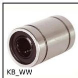
KB_WW Manicotto chiuso a sfere di precisione, Economica