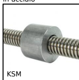
KSM Dado cilindrico in acciaio, Acciaio - 1 filetto