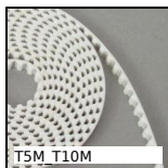
T5M T10M Cinghia aperta al metro tipo T, T10 Poliuretano armatura in acciaio