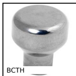
BCTH Pomello a fungo Hygienic Usit®, Con foro filettato e collare alto