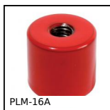
PLM-16A Magneze, Con foro maschiato