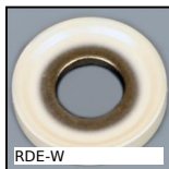
RDE-W Rondella di tenuta Hygienic Usit®, Inox - EPDM bianco