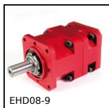
EHD08-9 Riduttore coassiale, da 35 a 50 Nm