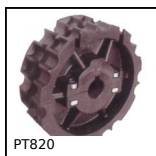
PT820 Pignone di trazione, Serie 820 e 815