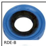
RDE-B Rondella di tenuta Hygienic Usit®, Stainless steel - EPDM blu