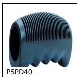
PSPD40 Manopola a pressione, PVC nero