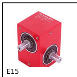
E15 Riduttore a rinvio angolare, da 0.40 a 2.53 Nm