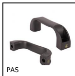
PAS Maniglia a ponte, Reinforced PA thermoplastic