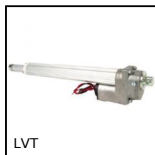
LVT Mini martinetto motorizzato 1A, 1 ampere