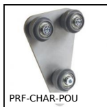
PRF-CHAR-POU Attrezzi, Carrello attrezzi