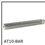
AT10-BAR Barra dentata, AT10