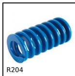
R204 Molla per stampe ISO10243, Medio