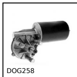
DOG258 Motoriduttore DC 12V e 24V DC, da 12 a 15 Nm