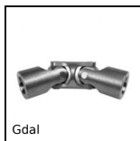
Gdal Giunto cardanico doppio serie eco, Sollecitazioni leggere