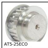
AT5-25ECO Puleggia dentata di posizionamento tipo AT, Serie economica - AT5 al...