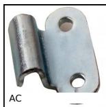
AC Piastrina di riscontro, 15mm