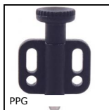
PPG Pistoncino a molla, Con flangia di fissaggio orizzontale