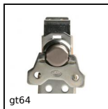
gt64 Chiusura a farfalla, Tolleranze di montaggio normali