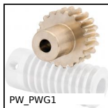
PW_PWG1 Ruota di precisione, Bronzo