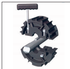
Two part design