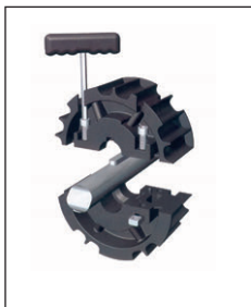
Two part design