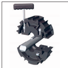
Two part design