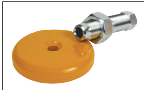
Stem ready to install in insert