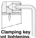
Clamping key Front tightening, 1 spring