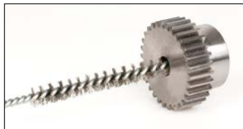
Deburring a gear bore