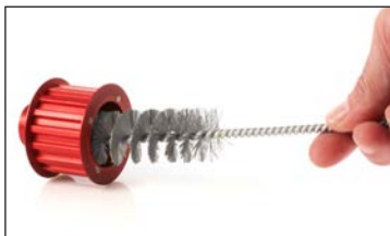
Stripping of a pulley bore