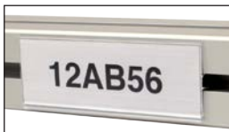
Mounted on a profile