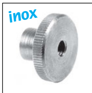
Versione alta EMS-H