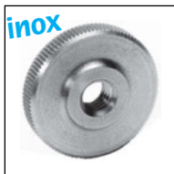
Versione bassa EMS-B