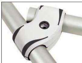
Typical assembly using two CGT-L45-BN