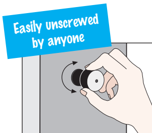
Same tightening torque